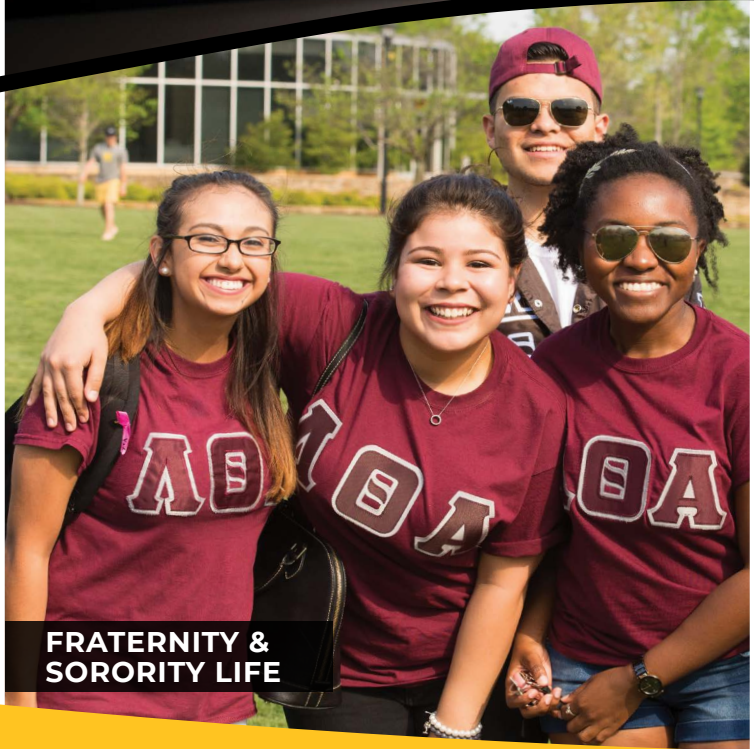
FRATERNITY & SORORITY LIFE