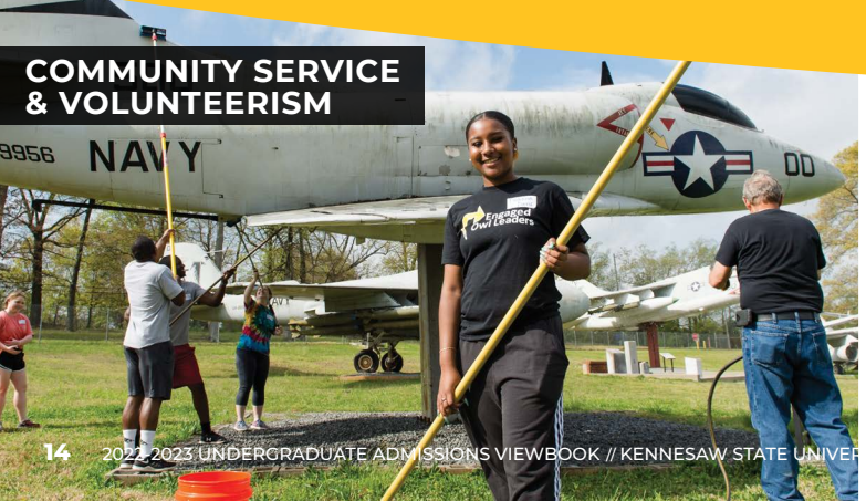
COMMUNITY SERVICE & VOLUNTEERISM