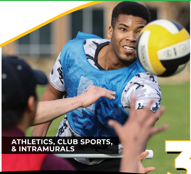
ATHLETICS, CLUB SPORTS, & INTRAMURALS