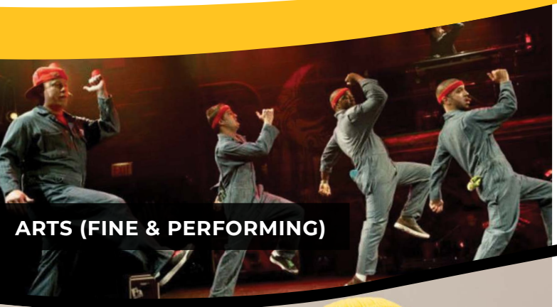
ARTS (FINE & PERFORMING)