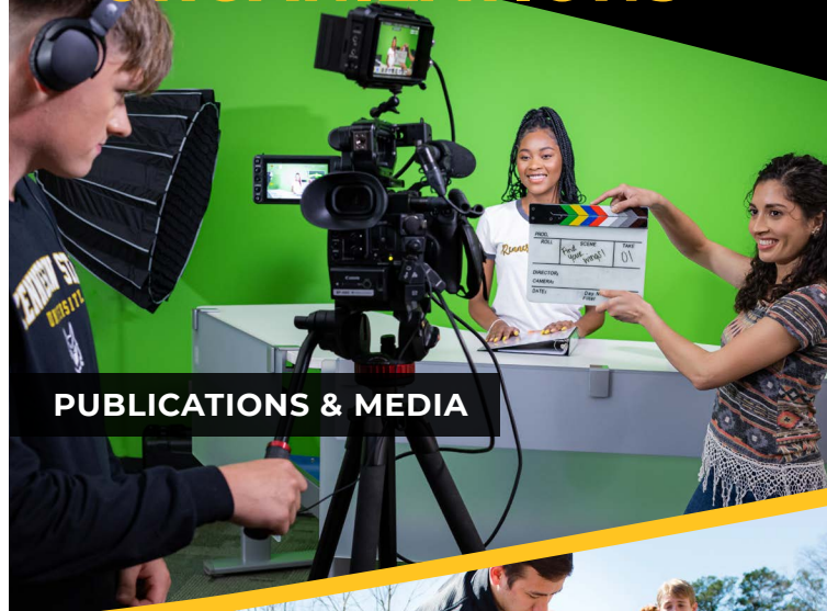
PUBLICATIONS & MEDIA